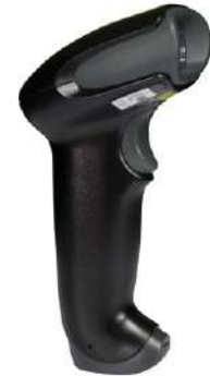
Fig. 1: Voyager 1250g Scanner

Voyager 1250g provides superior scan performance and extended depth of field, which combine to deliver an ergonomic solution for scan-intensive applications.