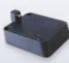
Ethernet Adaptors (Single: 94ACC0297 / Triple: 94ACC0288)