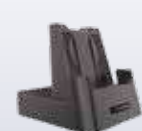
94A150095 Single Slot Charging Dock