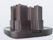
94ACC0192 4-slot Battery Charging Dock